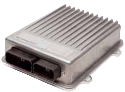
The Navigation Controller II receives user, satellite, correction and steering inputs and provides the control to guide the tractor. It includes three gyrometers and accelerometers for operation in uneven terrain.